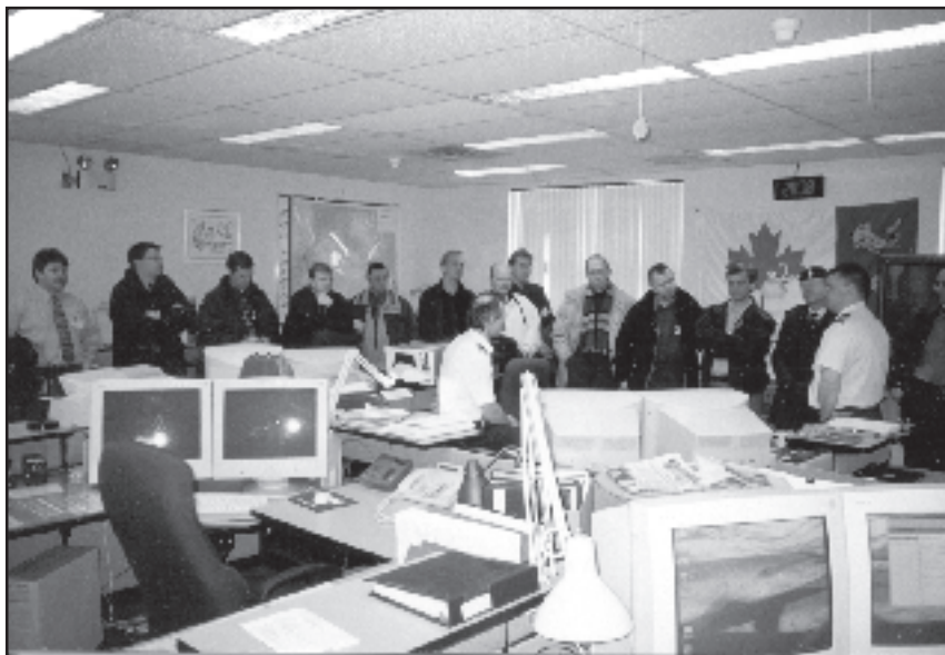
LEFT Workshop participants receive briefing.

The workshop's objectives were threefold: provide an overview of the Canadian Forces' response to a major air disaster, discuss the roles and expectations of the various stakeholders during an incident response, and identify conflicts and redundancies in the response and recommend planning changes to address these problem areas. Presentations made by staff from the Canadian Forces' included: